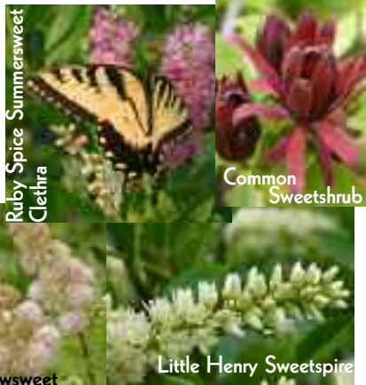
Ruby Spice Summersweet Clethra