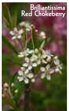
Brilliantissima Red Chokeberry