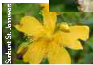
Sunburst St. Johnswort

©2008 Beeson's McHenry County Nursery. All Rights Reserved.