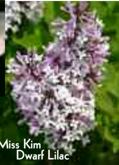
Miss Kim Dwarf Lilac